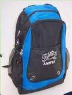
FS22 Backpack w36xh47xd21