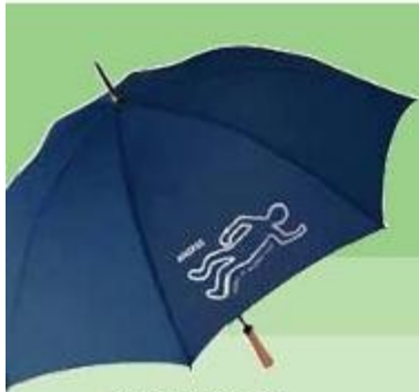
FS19 Golf Umbrella