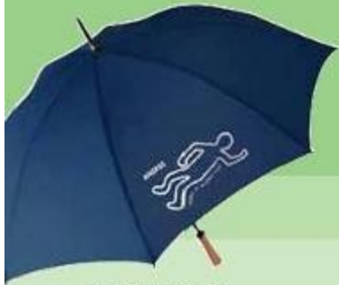
FS19 Golf Umbrella