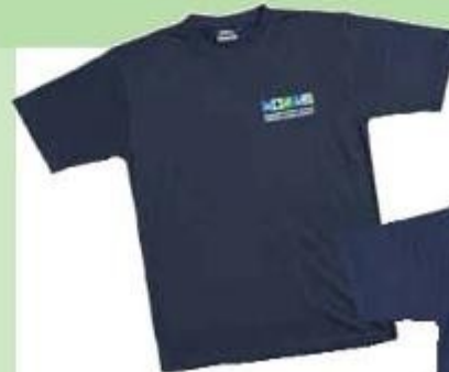
FS28 Mens T-Shirt navy sizes: 2XS - 3XL