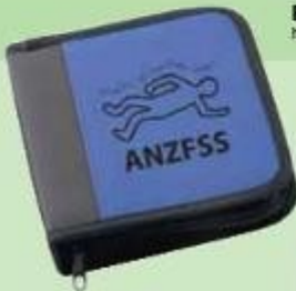
FS23 CD Carry Case holds 24 cds