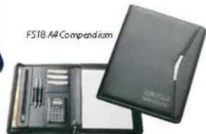
FS18 A4 Compendium