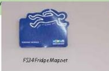
FS34 Fridge Magnet