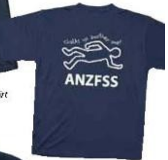
FS39 Ladies T-Shirt navy sizes: 8-20