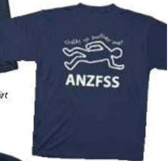
FS39 Ladies T-Shirt navy sizes: 8-20