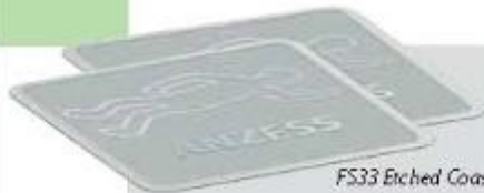
FS33 Etched Coast