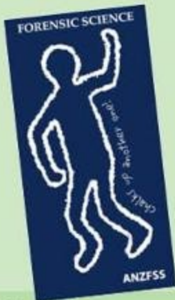
FS5 Beach Towel