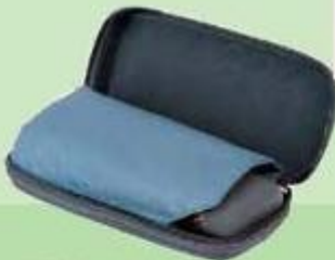
FS21 Travel Umbrella 48cm