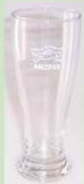
FS31 Beer Glass