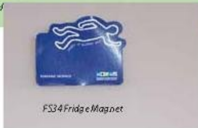
FS34 Fridge Magnet