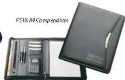
FS18 A4 Compendium