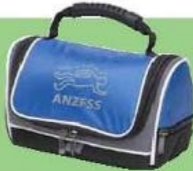
FS27 Lunch Pack Cooler holds 4x 375ml drink cans