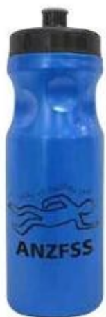
FS7 Drink Bottle 650ml