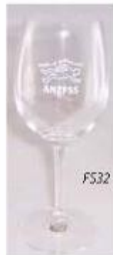
FS32 Wine Glass