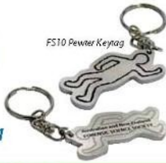
FS10 Pewter Keyring