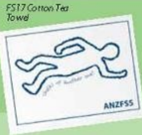
FS17 Cotton Tea Towel