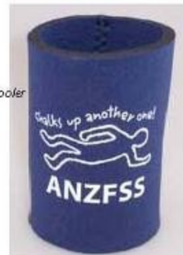
FS8 Drink Cooler