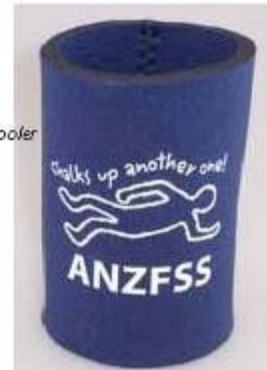
FS8 Drink Cooler