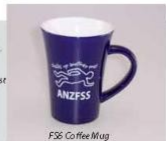
FS6 Coffee Mug