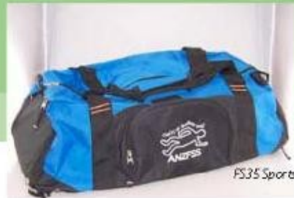
FS35 Sports Bag