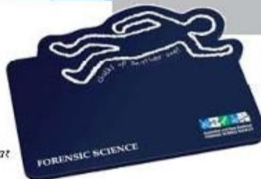
FS9 Mouse Mat